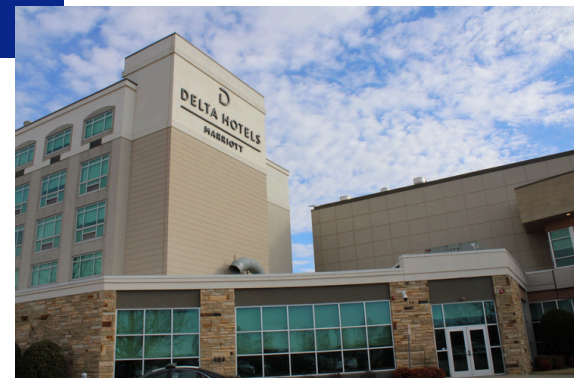
Delta Hotels by Marriot